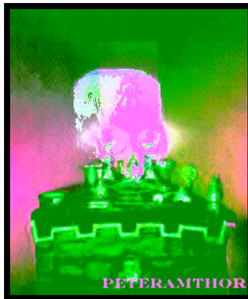
~::Altar by Peter Amthor::~~

Chokmah doesn't have one central body any longer. Instead he is present in several of the core religious buildings around the world. Cracks that have existed for centuries slowly 'heal' up. Those inside are a little harder to be controlled by any outside forces. Anybody not of the religion that the building is dedicated to seem to get the feeling of always being watched by someone unseen.